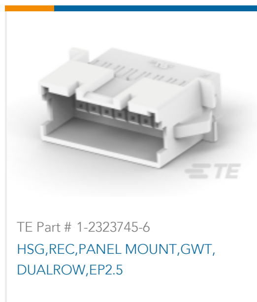
TE Part # 1-2323745-6 HSG,REC,PANEL MOUNT,GWT, DUALROW,EP2.5