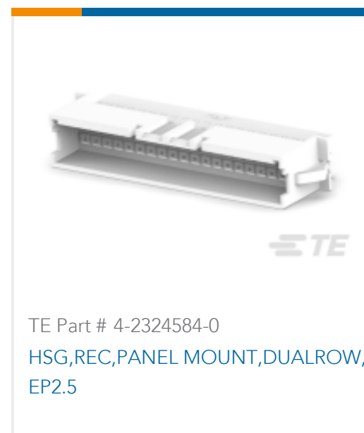
TE Part # 4-2324584-0 HSG,REC,PANEL MOUNT,DUALROW, EP2.5