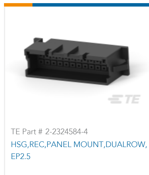
TE Part # 2-2324584-4 HSG,REC,PANEL MOUNT,DUALROW, EP2.5